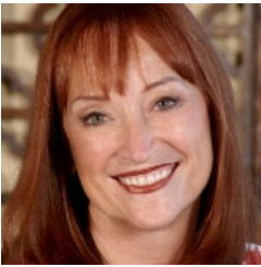
Sandra Betzina - Power Sewing

Sandra Betzina is an international lecturer and author of many sewing books, including her 2 new releases: POWER SEWING TOOLBOX 1 & 2. She has produced 12 instructional DVDs, written a syndicated sewing column and hosted a sewing show for HGTV for 6 years. Sandra designs a line of patterns for Vogue, called Today's Fit which are based on a ready to wear sizing bloc, which actually fits people. Sandra also writes fitting and sewing articles for Vogue Pattern Magazine, Threads and Sew News.